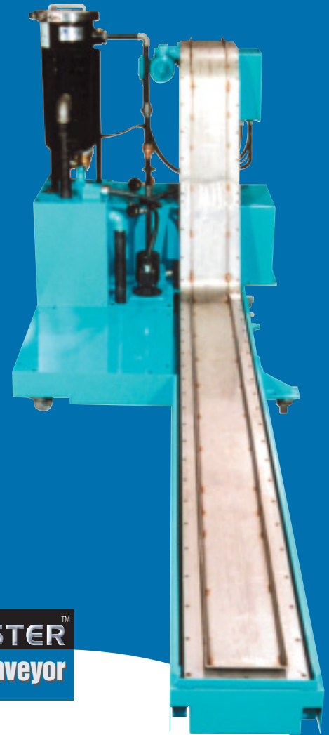
CHIPMASTER™ Magnetic Conveyor

Master Conveyors is a value-priced manufacturer of products for the metal working industry. In addition to manufacturing Magnetic Conveyors, we also manufacture a full-line of conveyor systems including Hinged Steel Belt, Drag-Out and Filter Conveyors under the ChipMaster™ brand name.